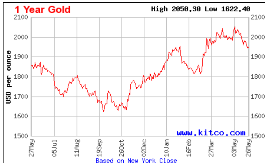
Price of gold (1-year chart)

The tables below outline the historical 1-year and 10-year gold and silver price movements per ounce.