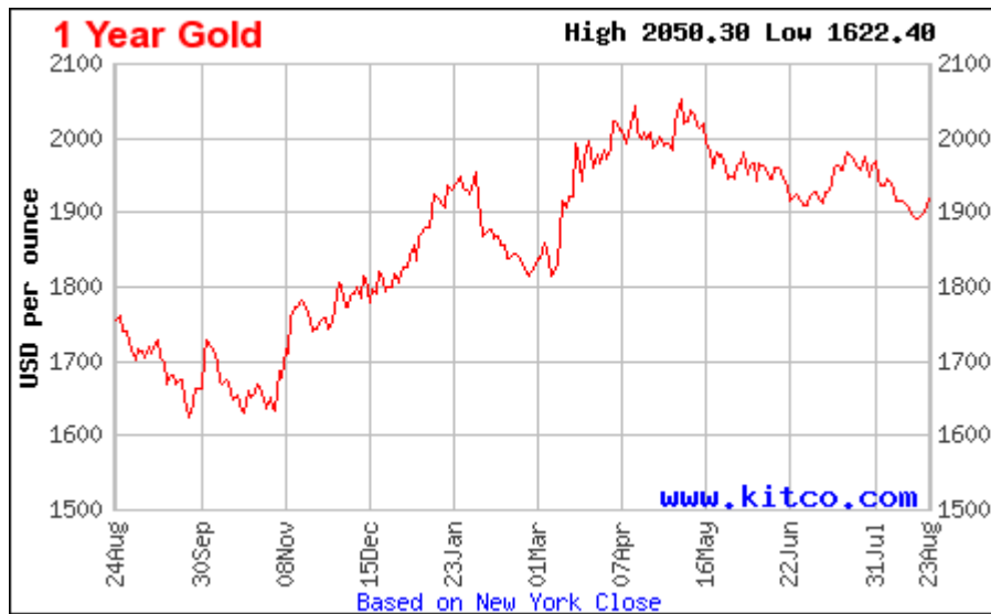
Price of gold (1-year chart)

The tables below outline the historical 1-year and 10-year gold and silver price movements per ounce.